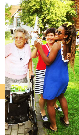
Part of our team

You have been part of our team since the beginning: A celebration for all residents under the motto: „A trip around the world“ (in Summer 2019).