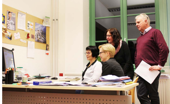
Contact via videocall