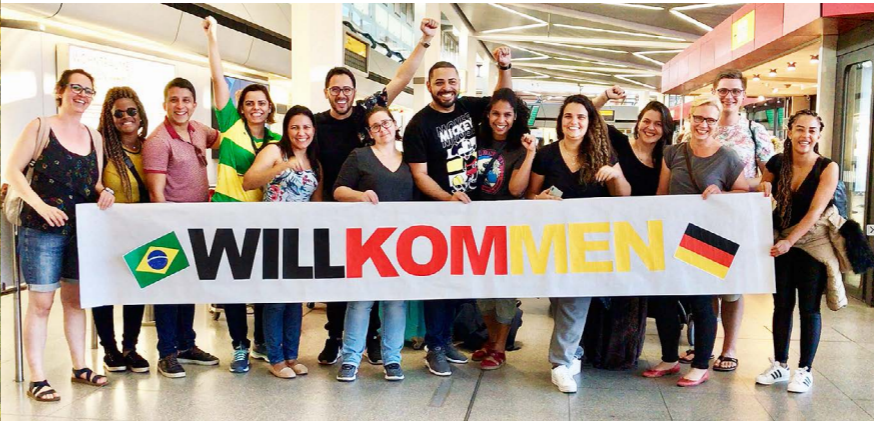
Welcome at the Airport